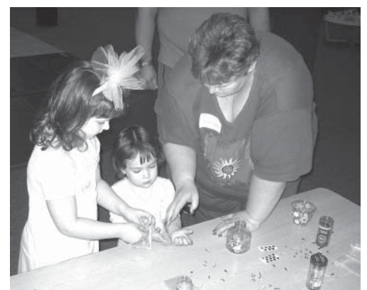
Above: The Portman family works together, adding various spices for the spice bag.