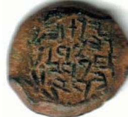
Obverse: "YNTN High Priest and the Jewish 'hever'"