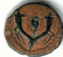
Reverse: double cornucopia

Some of you know that I have developed an interest in collecting artifacts connected with Jewish history. In addition to oil lamps and other pottery as much as 4,000 years old, I have begun a collection of ancient coins of the Land of Israel.