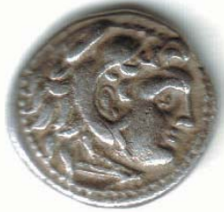
Obverse: Herakles (Hercules)