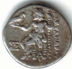
Reverse: Zeus with eagle; inscription: "Of Alexander"