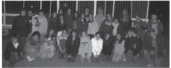
SZSL Kadimaniks and Columbia middle schoolers pose in front of the wagon after the hayride.