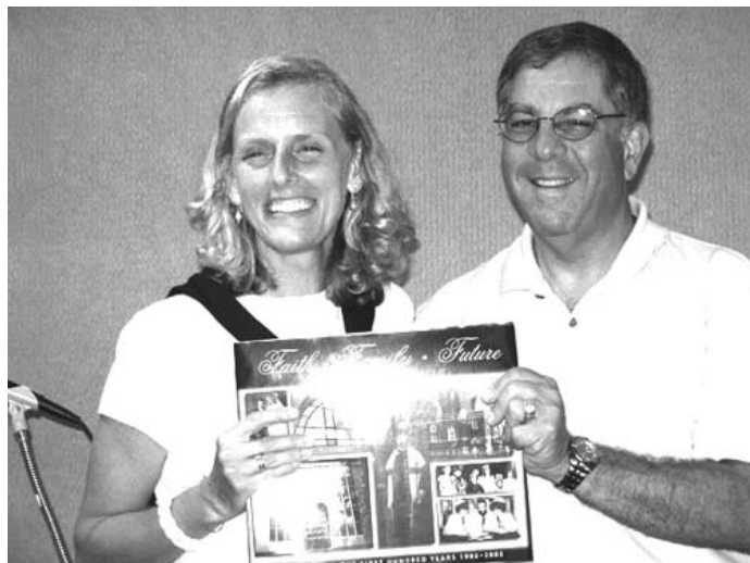
Left: Participants from the Lincoln trip to Springfield.

I am convinced that this alliance of enlightened and moderate voices, dedicated with their heart and soul to the Zionist cause, will become a major factor in the Zionist Movement, leading it towards fruitful action for the future of the Jewish People.