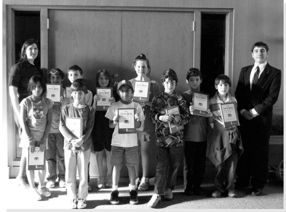
The "Gimel" class of 2011 celebrating Siyum Hasefer